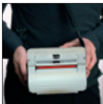
Carry belt supplied

MB400i is equipped with factory-installable sturdy rubber housing. The ruggedized design makes these printers ideal for high-usage, high-impact applications.