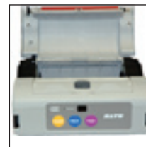
Drop in media loading