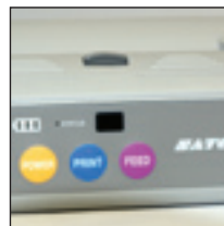
Easy operation: printer control via only three buttons