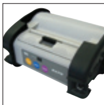
Impact resistant: extra protection against shock, drops and mishandling