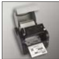
Easy media loading (5" OD labels can be loaded)