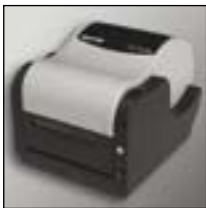
Small footprint for desktop and office use