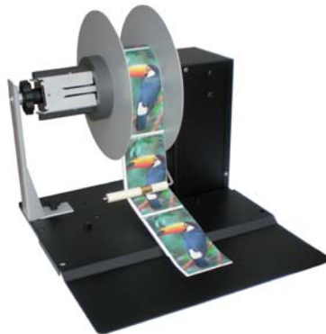
Smart Label Rewinder AD1224-S4